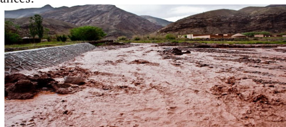
Figure-3. 2012-happened in the territory of the republic of the year on May 10-16 flood flows.

For the purpose of evaluating flood flows and quantitative indicators of specific floods in objects affected by flood events, including hydrotechnical structures and water-conducting structures in them, it is recommended to select control points in Rivers and streams where the flood is observed and conduct seasonal and regular hydrological, hydrometric, geological and geodesic monitoring in these nuances.