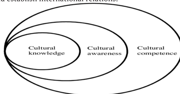
Figure 2. Structure of cultural consciousness

communicate effectively with members of other cultures and establish international relations.